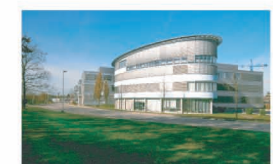
6 Innovations Center for Biotechnology (IZB) Am Klopferspitz 19 82152 Martinsried