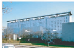
3 University Hospital of the LMU, Faculty of Med. Marchioninstr. 15 81377 Munich