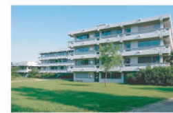
5 Max Planck Institute of Biochemistry Am Klopferspitz 18 82152 Martinsried