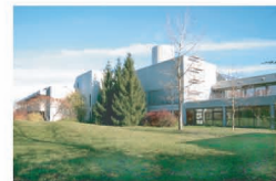
4 Max Planck Institute of Neurobiology Am Klopferspitz 18 82152 Martinsried