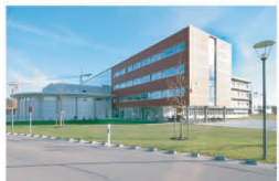
1 Office, D01.049 BCCN Munich Grosshadernerstr. 2 82152 Martinsried