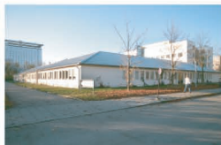
2 Faculty of Medicine of the LMU, Neurology Marchioninstr. 23 81377 Munich